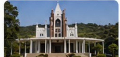
मिजोरम शांति स्मारक