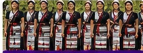
Traditional Mizo Attire