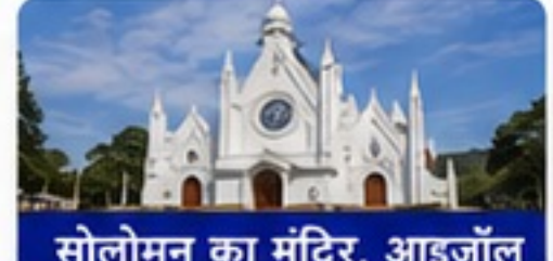
सोलोमन का मंदिर, आइजॉल