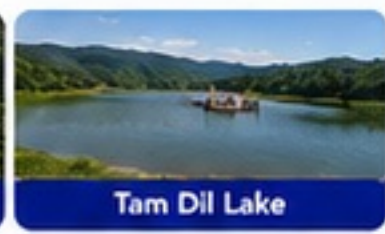
Tam Dil Lake