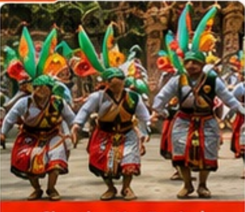
Chapchar Kut Festival