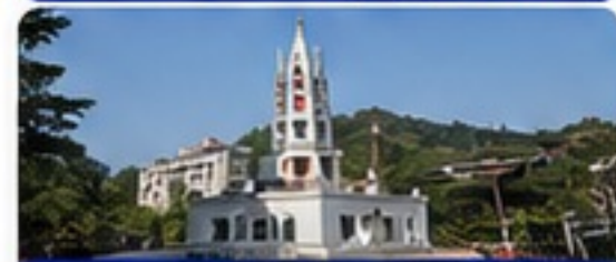
Mizoram Peace Accord Memorial