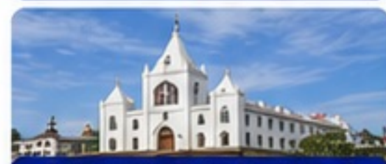
Solomon's Temple, Aizawl