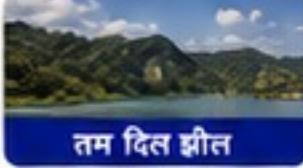
तम दिल झील