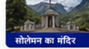
सोलोमन का मंदिर