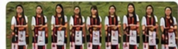
पारंपरिक मिजो परीधान