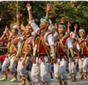
चपचार कूट महोत्सव