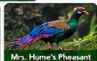
Mrs. Hume's Pheasant